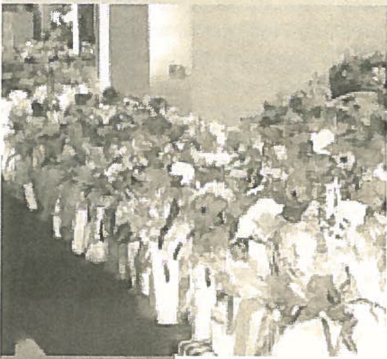
Filled to the brink, Karen Char's living room overflows with donations . . .